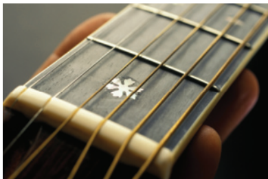
Figure 2 The diameters of the guitar strings shown here are getting progressively larger from left to right. The linear density is therefore increasing from left to right. The speed of sound is progressively slower in these strings.

linear density ( \mu ) the mass per unit distance of a string; units are kilograms per metre (kg/m)