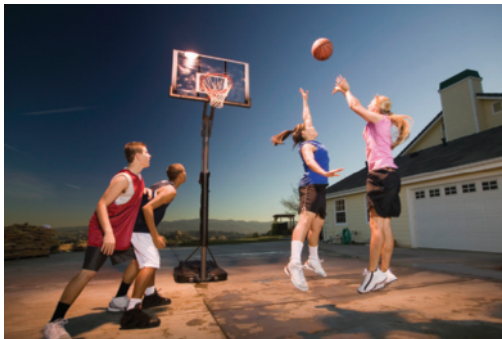
Figure 1 Earth's gravity plays a key role in basketball and most other sports.

During a basketball game, the player takes the ball and shoots it toward the basket (Figure 1). The ball briefly skims the rim, then drops through the net to the floor. The player makes the basket because of her skill, with a little bit of help from the force of gravity. Gravity causes all objects to accelerate toward Earth's centre. If you have accidentally dropped an object such as a glass, you have directly experienced how significant the effect of gravity is.