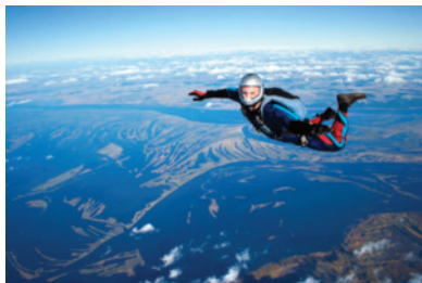
Figure 3 The value of 9.8 \text{ m/s}^2 for acceleration near Earth assumes that there are no other forces acting on an object, such as air resistance.